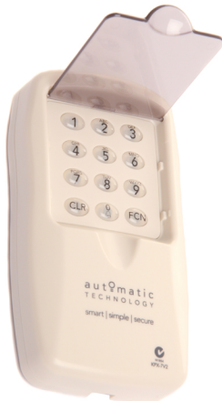
ATA KPX7v2 Keypad