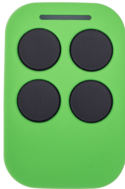
Auto Openers C945