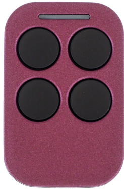
Auto Openers BHT3