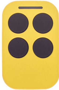
Auto Openers BHT4