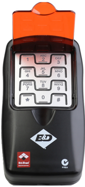
B&D KPX7v1 Keypad