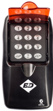
B&D KPX7v2 Keypad