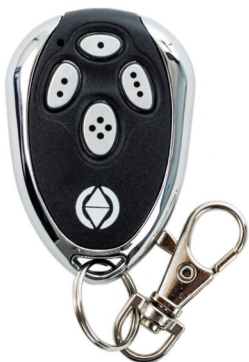
Aftermarket Smart Opener